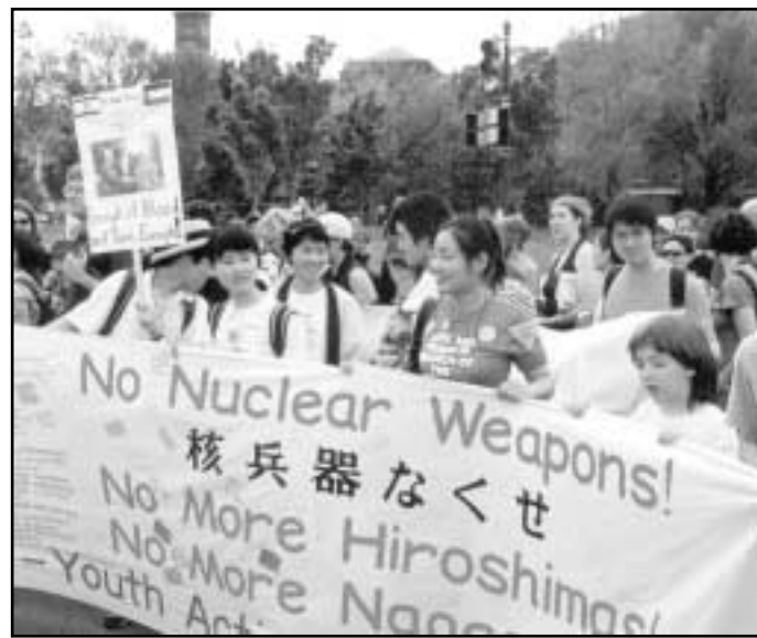
March on Washington, April 2002. The international community expects the U.S. and other nuclear powers to fulfill their treaty commitments to nuclear weapons abolition.

Sir Joseph Rotblatt, one of the fathers of the atomic bomb and the chagrined author of the concept of nuclear deterrence, reminds us that "the only alternative is the total elimination of nuclear weapons." He is clear that "We have to convince the public that the continuation of current policies...is bound to result in a nuclear holocaust in