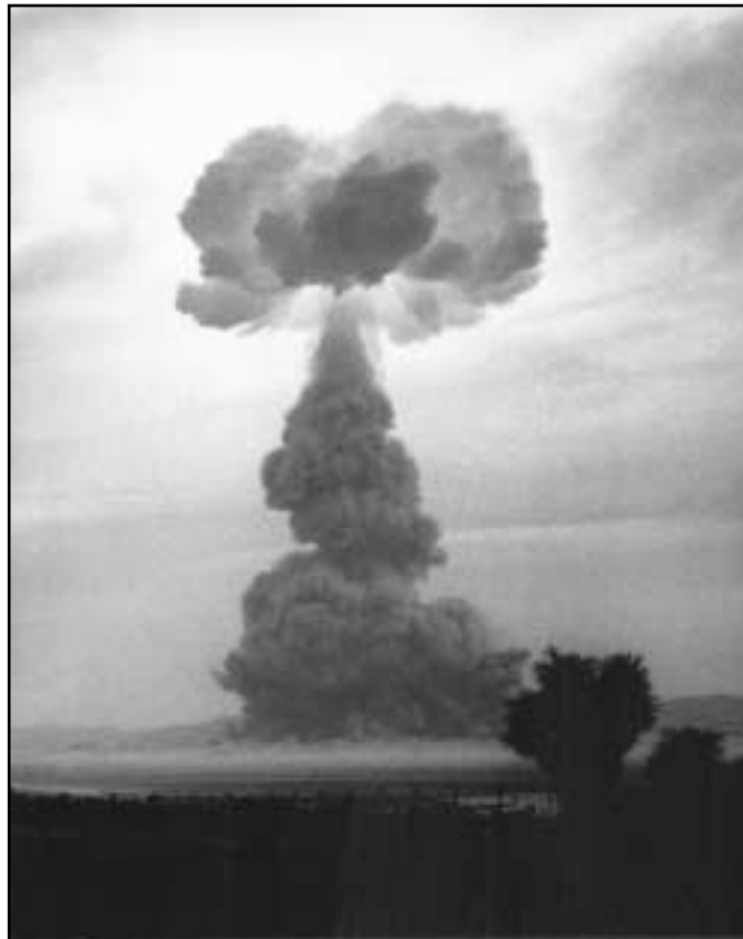
“Harry”, a 32-kiloton nuclear test exploded in May 1953 at the Nevada Test Site. The Harry shot resulted in the heaviest contamination of “downwinders” — civilians living downwind of the test site — of any U.S. continental explosion. 20